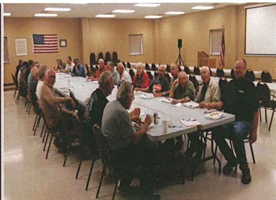
May 15 th Retiree Luncheon