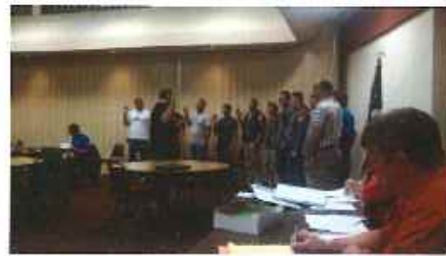
6/12/14 New Member Swear-In