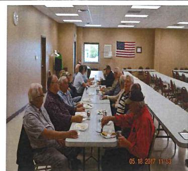
5/18/17 Retiree Luncheon